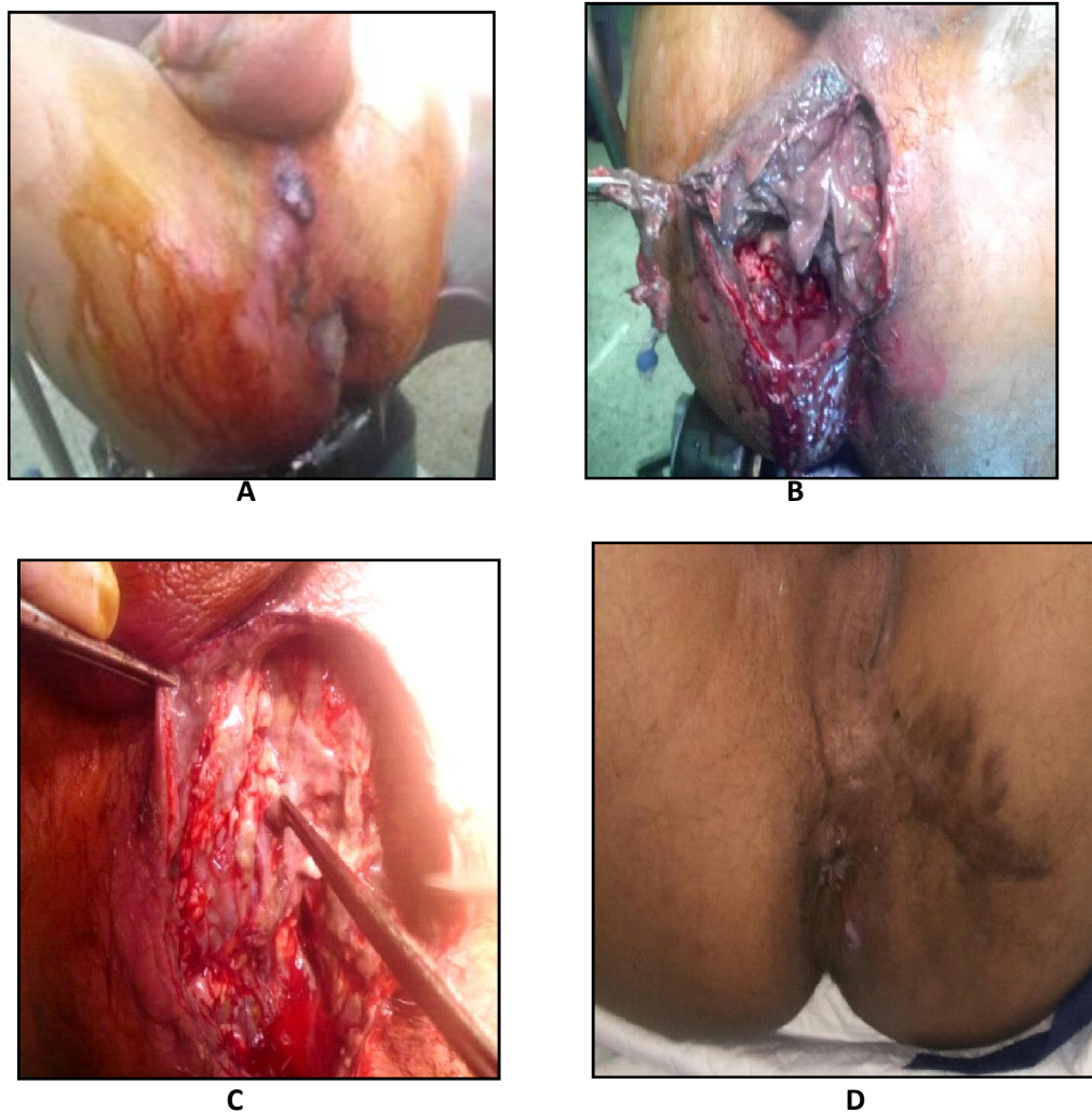
Figure 4. Fournier Gangrene (a) before management, (b & c) during intraoperative debridement, (d) after reconstruction by rotational flap